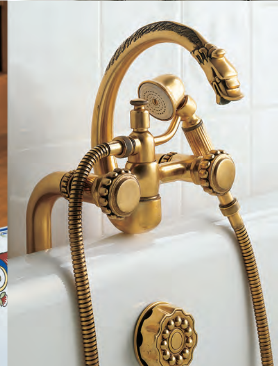
Above: 3030.48 “Royale” Exposed Tub & Shower Mixer in Pol. Chrome (48). Below: 2236.52 “Pompadour” Tub Filler with Hand Shower in Old Gold (52).