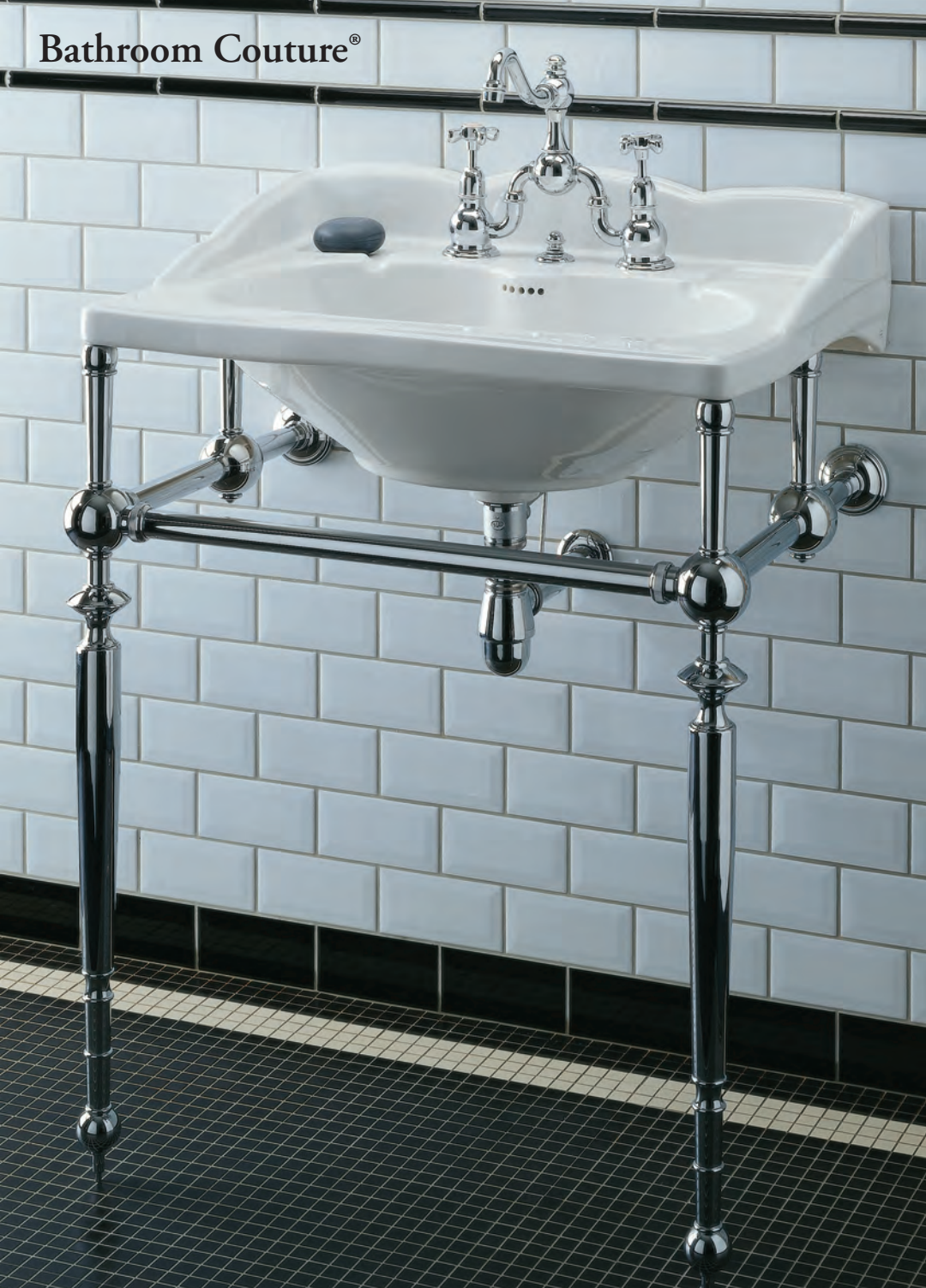
0320.20 and 0322.48 "Empire" Washbasin and Metal Washstand in Polished Chrome (48). The art of an ideal—the Empire takes its design cues from 18th Century Neoclassical architecture. Shown with 3003.48 "Royale" Two-Hole Bridge Faucet with optional 3080.48 Pop-Up Waste in Polished Chrome (48).