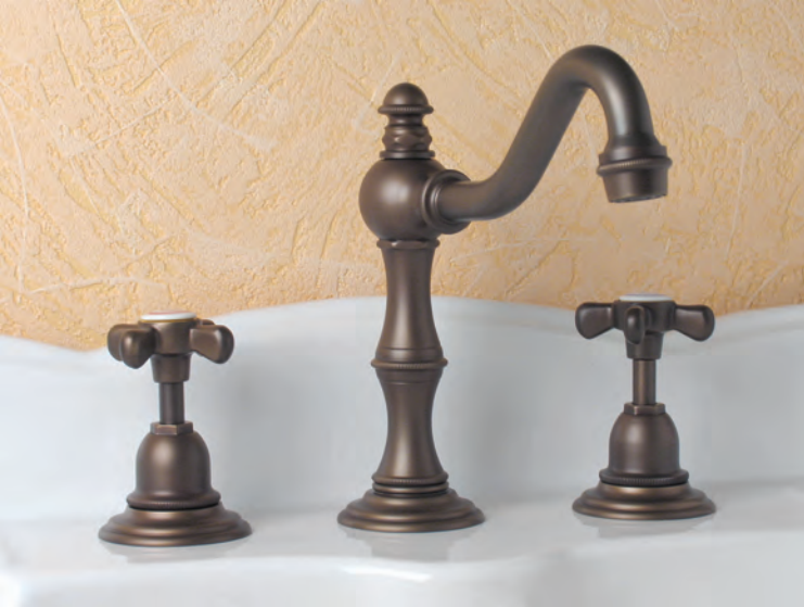
3002.70 "Royale" Widespread Lavatory Set. Based on an original turn-of-the century design by Desire Herbeau, the award-winning Royale faucet is often imitated but never duplicated. Shown in Weathered Brass (70).