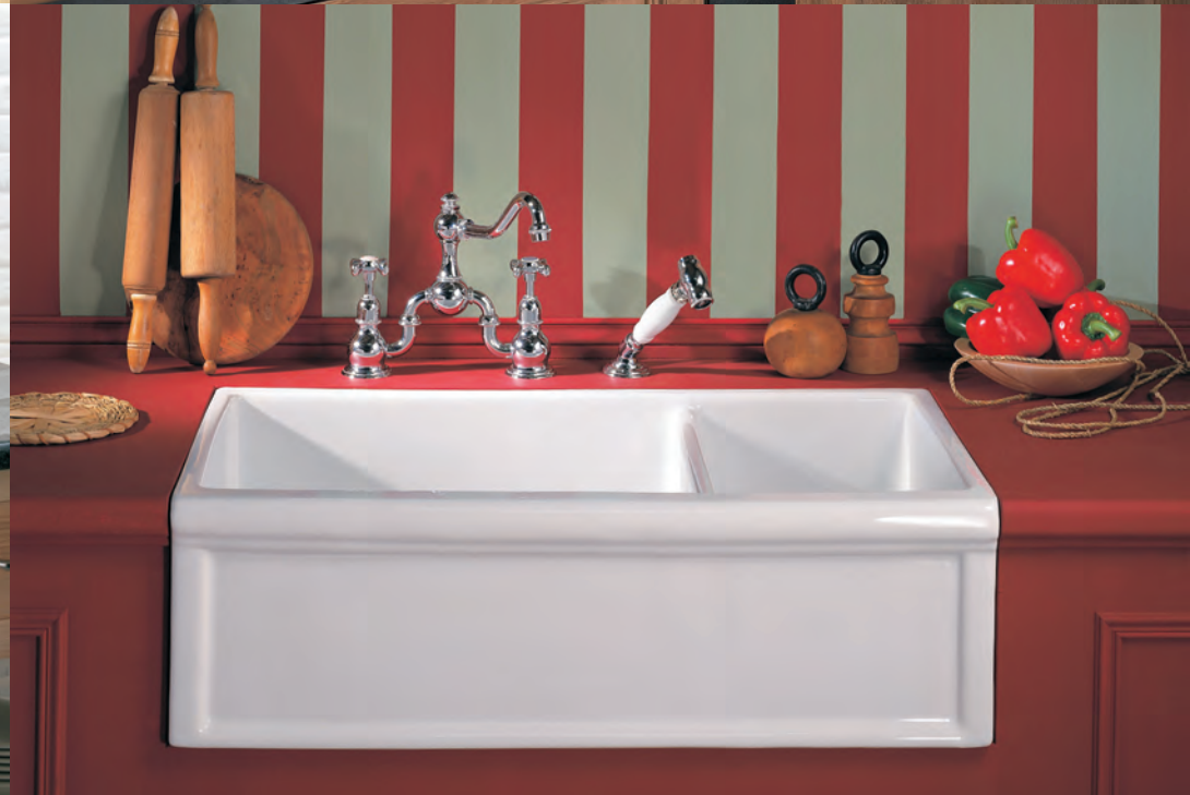
Above: 4603.20 “Luberon” Fireclay Farmhouse Sink in White (20) and 5701.63 Wooden Stand in Antique Stain (63). Shown with 4107.63.58 “De Dion” Wall Mounted Single Lever Mixer in Polished Cooper & Brass (58). Below: 4614.20 “Art Nouveau” Fireclay Farmhouse Sink. Shown in White (20) with 4106.63.56 “Estelle” Wall Mounted Single Lever Mixer in Polished Nickel (56).