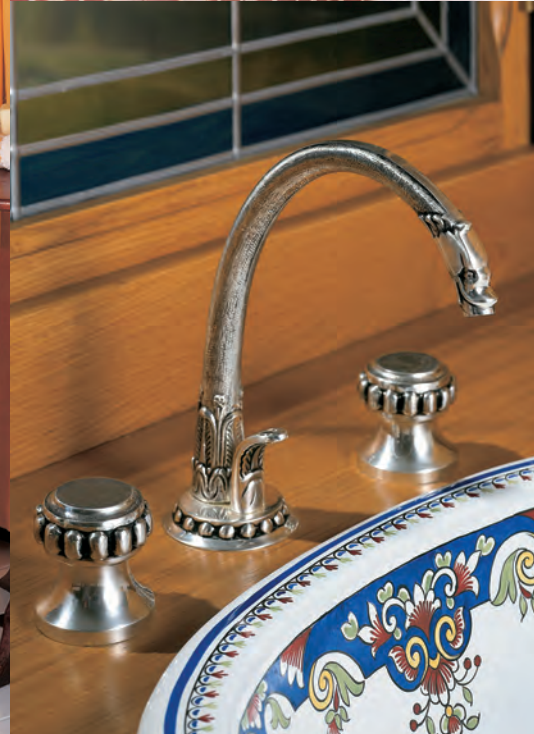
Above: 3630.56 “Monarque” Exp. Tub & Shower Mixer in Pol. Nickel (56). Below: 2232.53 “Pompadour” Wide-spread Lavatory Set in Old Silver (53).