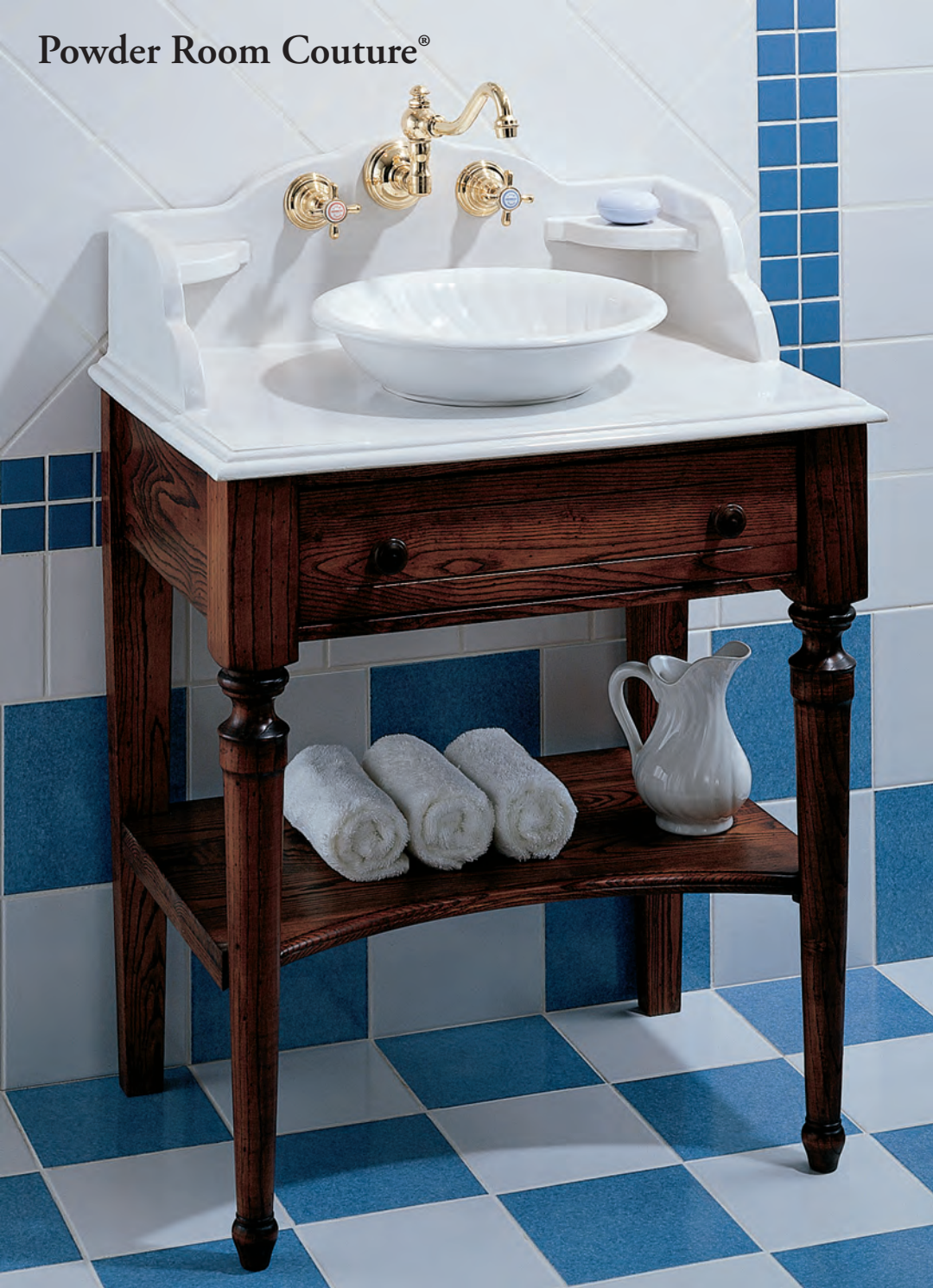
5830.63 "Bonne Maman" Bathroom Cabinet in Antique Stain (63). Shown with 5831.20 "Bonne Maman" Fireclay Countertop and 0409.20 Vitreous China Vessel Bowl in White (20) with 3008.49 "Royale" Wall Mounted Three-Hole Set in Solibrass (49) and 1420.20 "Bonne Maman" Pitcher in White (20).