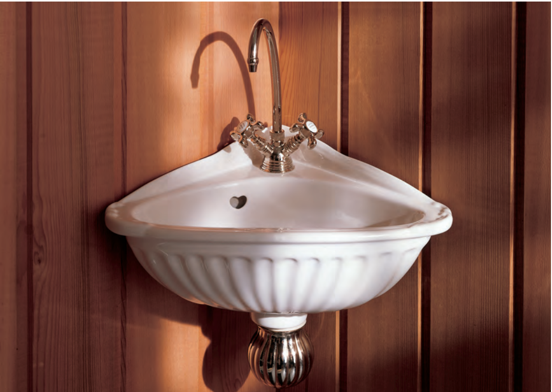
Above: 0106.20 "Carline" Corner Sink with 2121.56 "Sphere" Cover and 3050.56 "Royale Verseuse" Single-Hole Mixer in Polished Nickel (56).