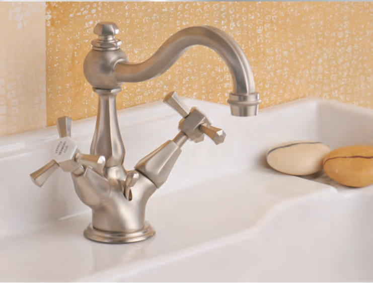
3601.57 "Monarque" Single-Hole Basin Mixer. The soft curves and hexagon detailing on this basin mixer brings haute style to the bath. Features a swiveling spout and white ceramic inserts. Shown in Brushed Nickel (57).