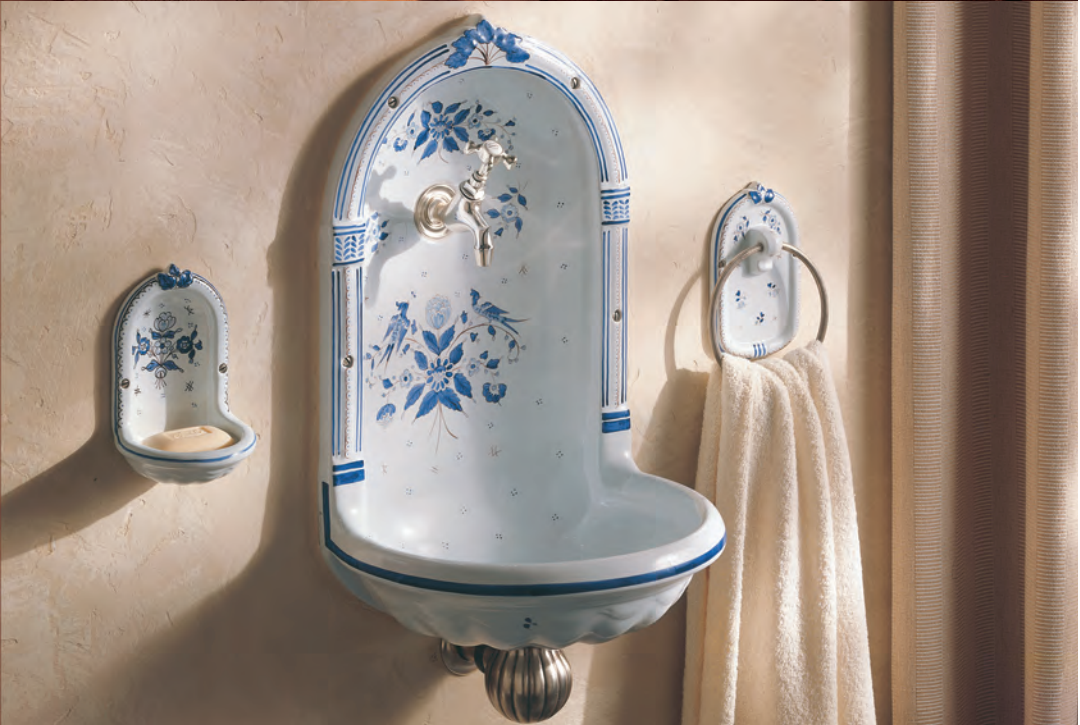
Below: 0201.02 "Niche" Fountain in Moustier Bleu (02), 1102.02 Soap Dish, 1112.02.53 Towel Ring and 2113.53 "Retro" Tap in Old Silver (53).