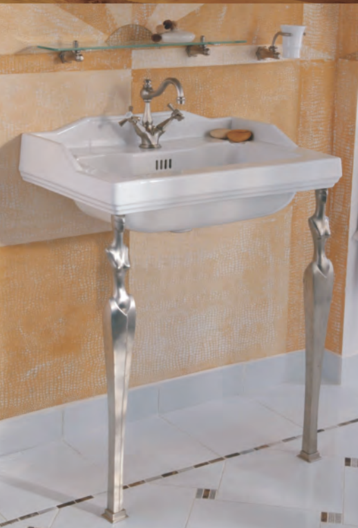
Above: 0303.20 and 0304.20 "Charleston" Washbasin and Pedestal. Below: 0340.20 and 0344.57 "Les Favorites" Washbasin and Washstand.