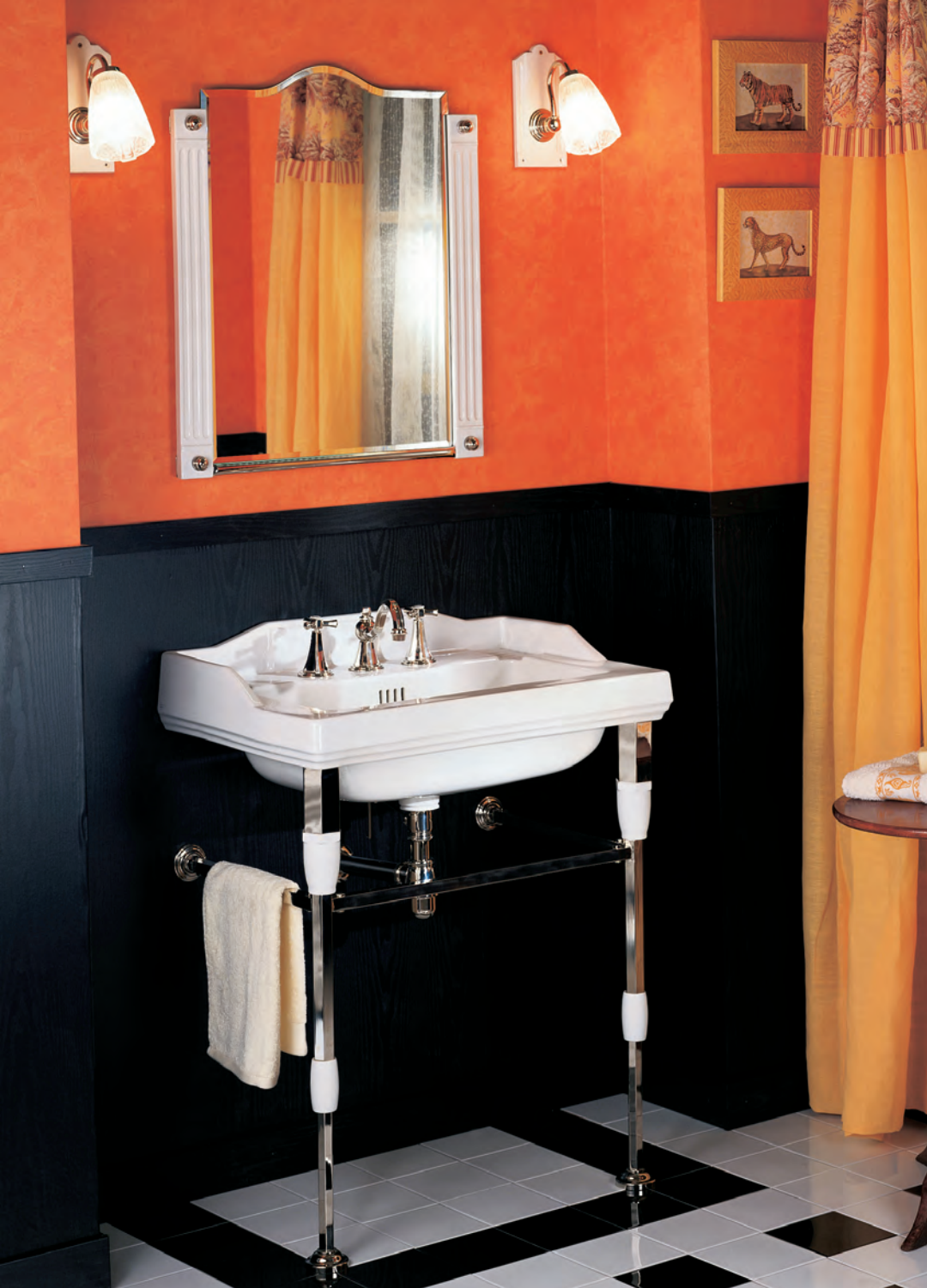
0340.56 and 0342.20 “Monarque” Washbasin and Metal Washstand. The “Monarque” Collection showcases the meticulous craftsmanship and striking design characteristic of French Art Deco. Shown with 1248.56 “Monarque” Mirror and 2 x 1249.56 “Monarque” Wall Lights in Polished Nickel (56).