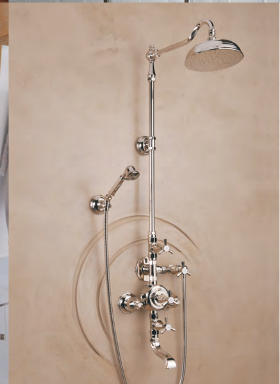
Above: 3402.70 "Royale" Exp. Therm. Shower Set in Weath. Brass (70). Below: 3701.56 "Monarque" Exp. Therm. Tub & Shower Set in Pol. Nickel (56).