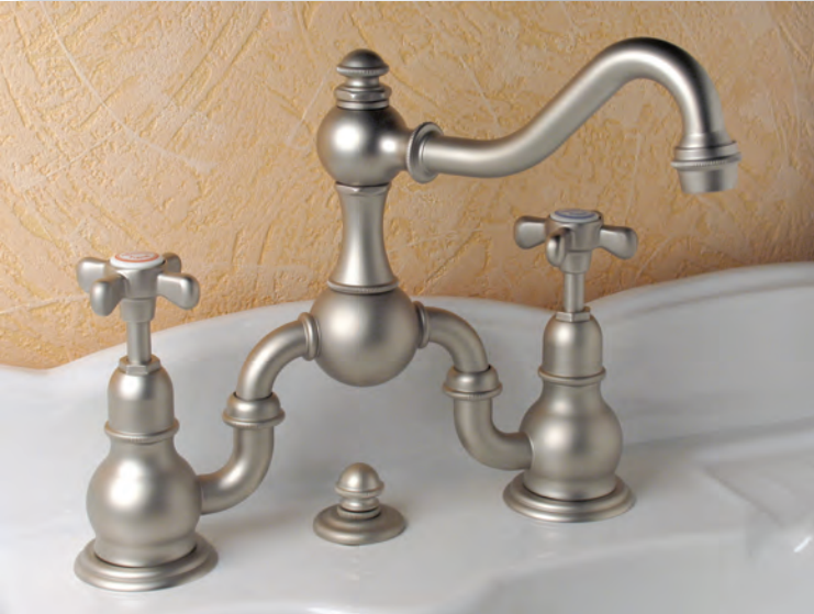
3003.60 "Royale" Two-Hole Basin Set. Authentic down to the signature red and blue taps, the Royale bridge faucet captures the joie de vivre of the Belle Epoque era. Shown in Satin Nickel (60) with optional 3080.60 Pop-Up Waste.